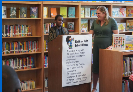
Hale Elementary New School Library - 6/21