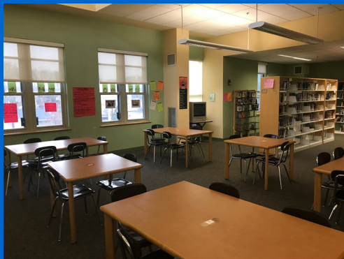
Mildred Avenue K-8 School Library Renewal