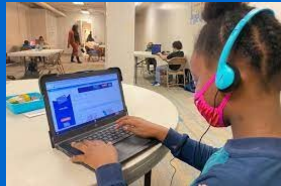
ChalkBeat Indiana, 3/2321